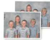
2x 5" x 3.5"