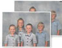
2x 5" x 7"