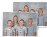
2x 5" x 3.5"