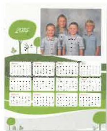
1x Photo Calendar 10" x 8"

*Only available when purchasing one of the packs listed above.