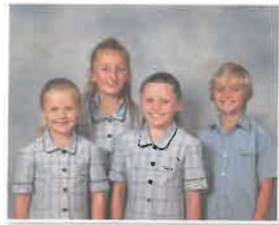
1x 10" x 8"