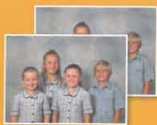
2x 5" x 7"