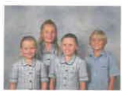
1x 5" x 7"