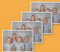
4x 5" x 3.5"